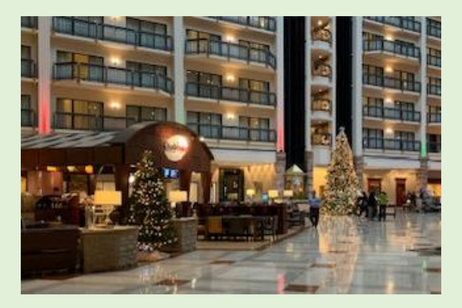
Lobby of the Renaissance Hotel in Austin where our June conference will be held