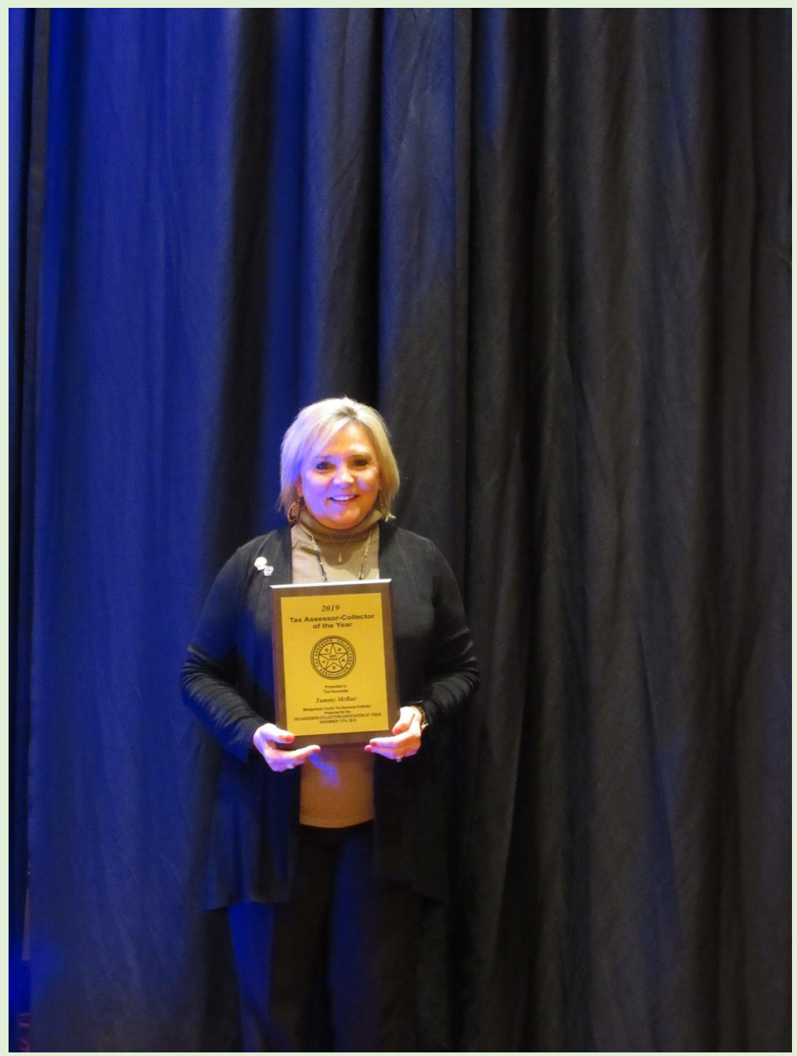
Recipient of the 2019 Tax Assessor-Collector of the Year