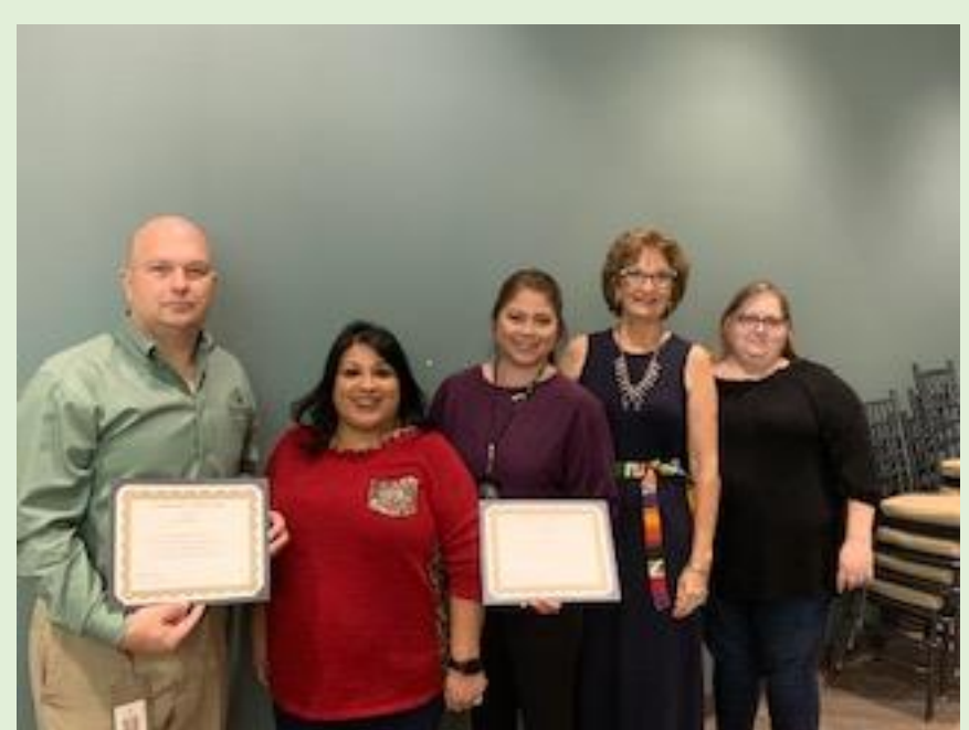
Comal County Staff Training