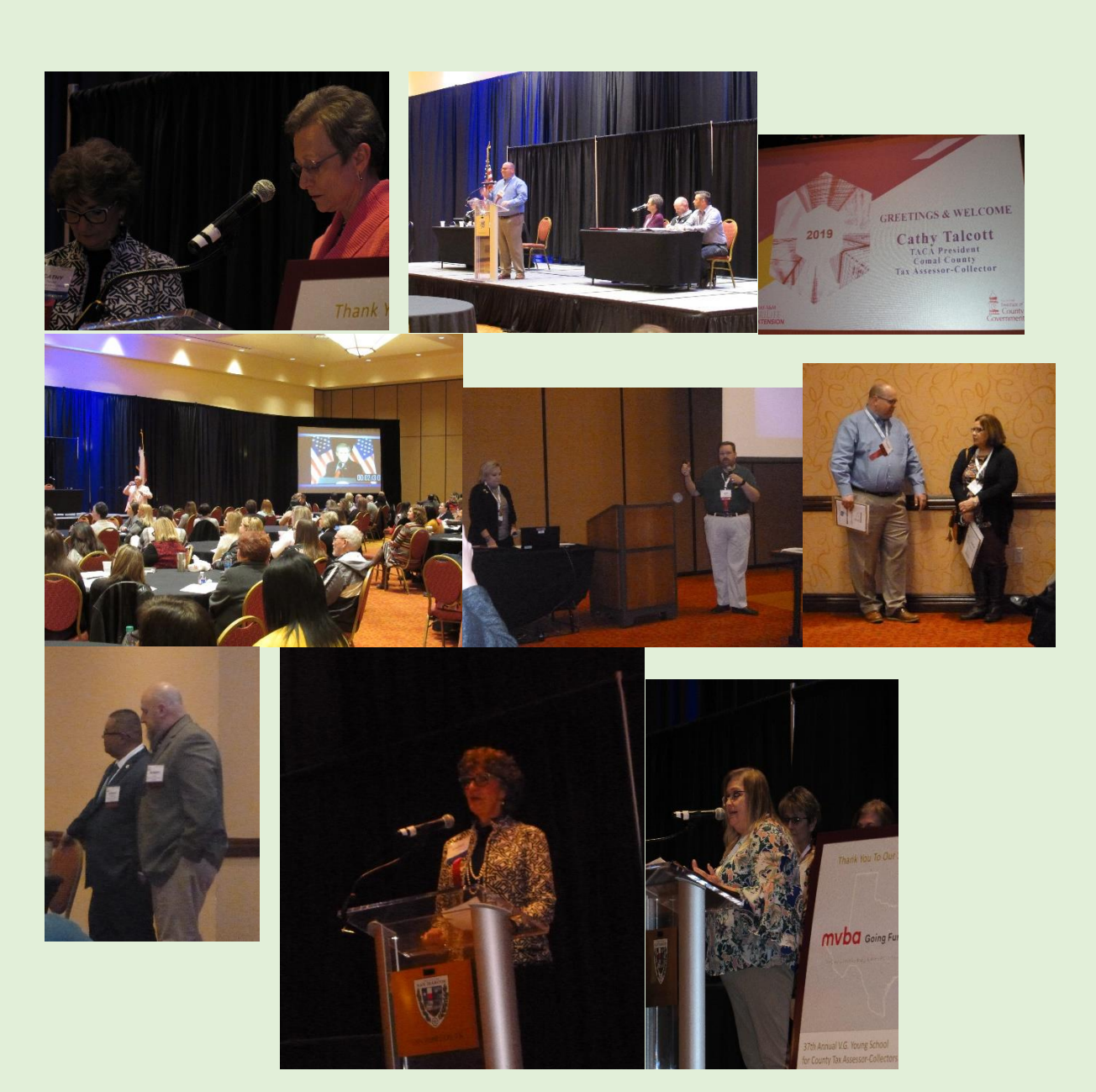
Page 21 of 25